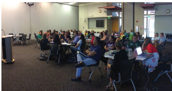
In July 2016, AZTransfer hosted a workshop for Arizona admissions and recruitment professionals that was attended by 47 representatives from across the state.