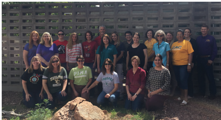
AZTransfer Facilitators at the 2016-2017 training retreat in Flagstaff, AZ