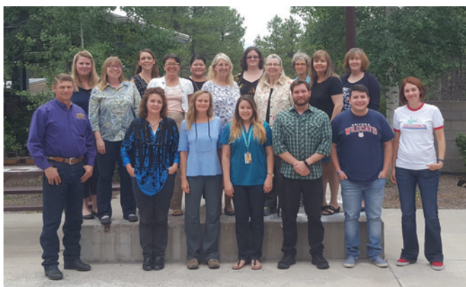
AZTransfer Facilitators at the 2017 annual training retreat in Flagstaff, AZ.